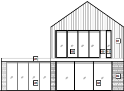
ELEVATION 03 REAR ELEVATION